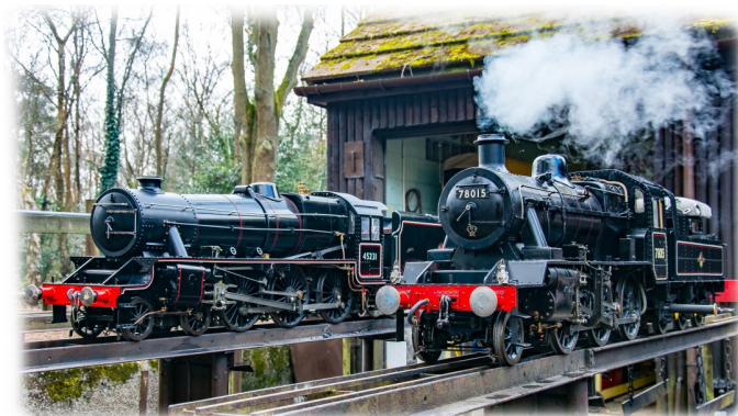
7¼ inch gauge LMS Class 5 4-6-0 45231 and BR Class 2 2-6-0 78015.