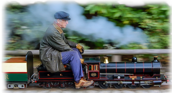
7¼ inch gauge NER T1 Class 0-8-0 Titan .

Pictured below are a selection of locomotives that are likely to be seen on a visit to Frimley Lodge Miniature Railway.