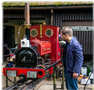
7¼ inch gauge Hunslet narrow gauge saddle tank 0-4-0 Nellie Madora .