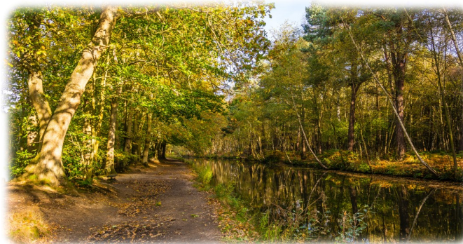
Basingstoke Canal close to Tom's Halt.

Frimley Lodge Park is a 60 acre site owned and managed by Surrey Heath Borough Council. In addition to Frimley Lodge Miniature Railway, the park boasts a range of facilities for all ages and hosts events for all the family. There are lots of open spaces and woodland, picnic areas, two children's playgrounds, a trim trail and meadows. In addition there are football and cricket pitches and a pitch and putt course.