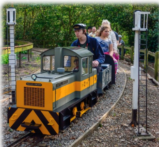
7¼ inch gauge narrow gauge diesel 0-6-0 Harlech Castle .